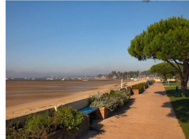
Beside the Basin d'Arcachon

Outside the clocher-porche stands a much more modern sculpture of a 'coquille', reminding pilgrims that from here they have just 1000 km to go to Santiago de Compostela.