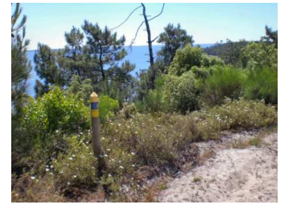
The Etang d'Hourtin-Carcans

The road ends at the beach and sailing club, and you can pick up the cycle track on the right hand side. After about 2km, the Chemin is signed off on the right, leaving the cycle track* only to return to it a few hundred metres later. At this point the marked path crosses and finally leaves the cycle track, and you need to stay with the path,