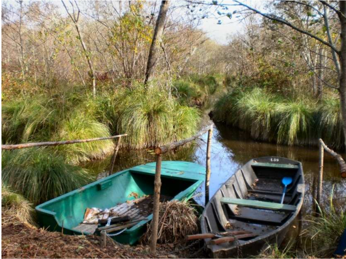
In the reserve of the Courant d'Huchet

offers pilgrims a gîte or caravan for 10 euros/person/night, and is open 1 st May to mid-September. Tel 08 90 71 00 01.