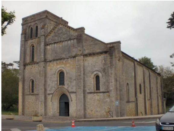
The Basilica at Soulac

reaching a tarmacked road on the outskirts of Soulac. Turn L into the Rue des Arros, which swings R to become the Rue du Prince Noir. At the end of this road turn R, then at the roundabout, cross over bearing slightly L (SP Centre Ville). The road now bends to the R (Rue du Maréchal Galliéni) and continues to the square and the basilica in the centre of town.