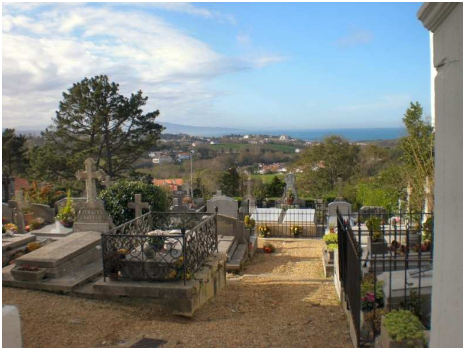
View from the church at Guéthary

For hotels and chambres d'hôtes, see website