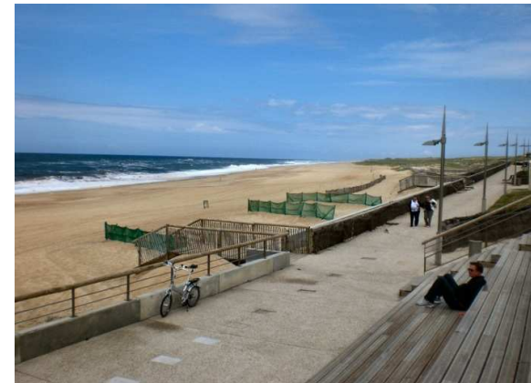
The sea front at Hossegor

On reaching the main road turn L, and follow this wide roller-coaster of a road for about 2km to a fork at a small roundabout. Keep R here (SP les Estagnots), then at a 2 nd roundabout 400m later, ignore the signs to les Estagnots and keep ahead. At a T-junction in 500m, turn R towards the dunes and KSO down this sandy road. At a roundabout (2km), bear R uphill on to the main road through Hossegor (there are better views of the sea from the promenade behind the buildings on your R here).