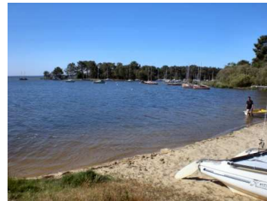
The beach at Piqueyrot

Attractive small lakeside village. Seasonal snack bar on lakeside. Water and toilets available at sailing club.