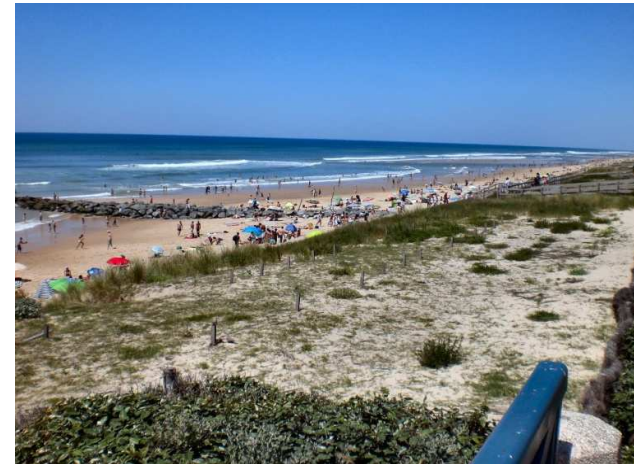
The sea-front at Lacanau-Océan

The three diversions suggested in this section avoid particularly sandy parts of the route.