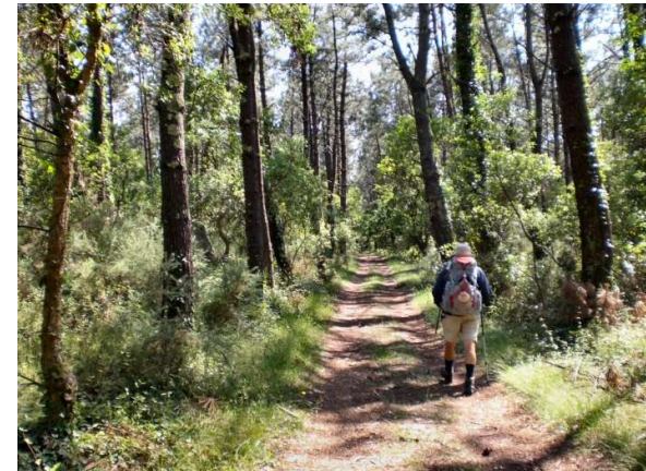
A pilgrim in the forest

From the Église St Nicholas, KSO to cross the Pont de la Halle and continue ahead to a T-junction. Turn L here, then in 500m, turn R up the Rue Barrat (easily missed). At its end, the Rue Barrat continues as a track into the forest. In 100m (alongside garden fences) fork L, then KSO for 500m to reach the banks of a canal. Turn R alongside the water, then bear R to skirt the edge of a campsite. At the end of the fence bear L, then KSO for 500m to a tarmacked road. Cross this diagonally L (beware – there is a second track which you do not want on the right) and continue into the forest.