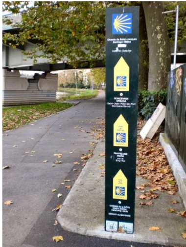
Sign beside the Nive at Bayonne

The urban section through Bayonne-Anglet-Biarritz is well waymarked, and more pleasant than you might expect. The far side is hilly, and a different world from the flat forests and rolling ocean of the Landes. This is classically Basque country – white houses with subtly coloured woodwork, churches with tiered wooden galleries, countryfolk wearing black berets, sheep with bells round their necks, and always the jagged Pyrenees for backdrop. The Côte Basque is spectacular, but the Chemin turns inland at Bidart and even at St Jean-de-Luz a diversion is necessary to admire the splendid sea front. The descent into Hendaye offers distant glimpses of the coast, but the signs then lead you undramatically through the back streets to the Pont St Jacques and the Spanish border.