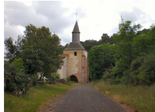
The clocher-porche at Mimizan

Pass the Pont de Gombaut on your right (do not cross) and KSO beside the water. Emerging beside the Pont Vignon (on your right), turn L on the main road (SP Plages-Océan). After 500m turn L on the Rue du Prat du Curé, and at the corner of the cemetery, bear to the R, passing behind it. At the far corner take the little road to the L (not the main road), which loops down to the historic Clocher-Porche (see below). Turn L on the main road to reach the centre of Mimizan.