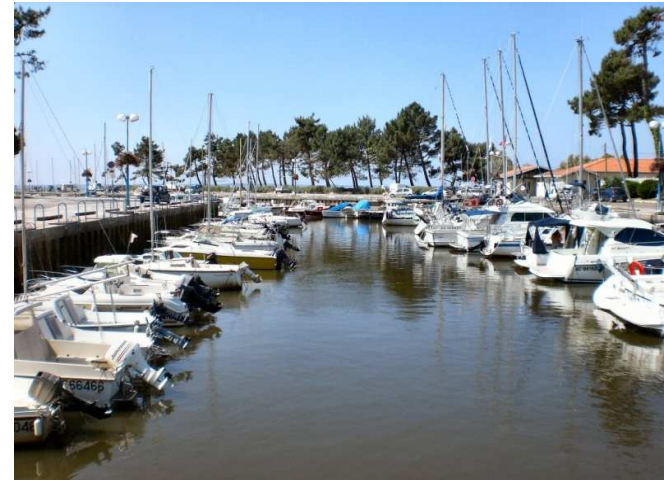
The harbour at Andernos

ahead on the beach beside the small lake, and on its far side take a path bending to the L. In 200m turn R to cross the wooden bridge. Now following the signs and keeping close to the sea there are some fine views across the Bassin before reaching a cluster of ponds on the left, and then arriving beside the oyster port at Andernos. Turn L on the road beside the port with its seafood restaurant and many oyster outlets, and then bear R to cross the head of each arm of the port. Continue between the church and the sea to where the remains of a Roman Villa are being excavated (water tap on R here)