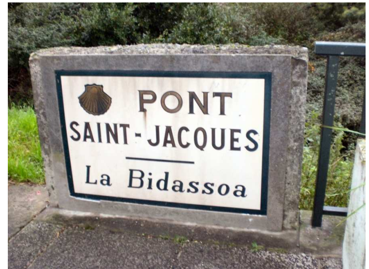
The bridge to Spain

overgrown) and climb the hill to arrive at a broad track. Bear R on this track (you are now briefly on the GR10, a long-distance path that traverses the length of Pyrenees) and KSO to a tarmacked road immediately before a telecommunications tower. Turn L downhill, and after 150m take a road on the R. This descends with good views of the bay and harbour to meet a main road (D358) in Hendaye. Turn L on the D358, and at the roundabout in 300m, turn R. At a second roundabout 300m later turn L on the Rue de Santiago (initially a wide road but dwindling as you progress). Reaching a small roundabout (400m), bear ahead-right to descend to a main road (N111) at a complicated junction. Cross over, bearing half-right to a road SP Irún. This quickly climbs to arrive at the Pont St Jacques / Puerte de Santiago, the bridge over the Bidassoa that will carry you into Irún to continue the journey.