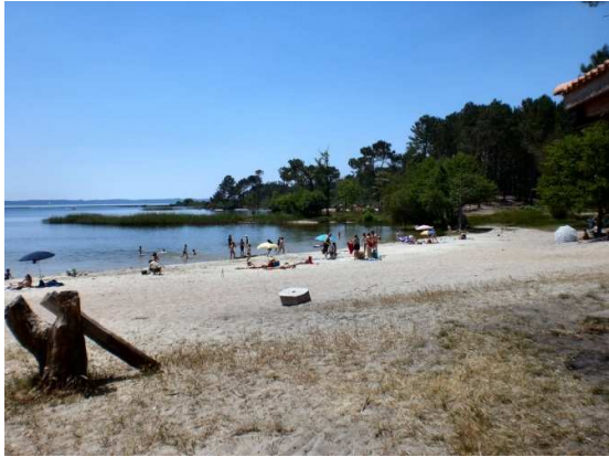
Beside the lake at Sanguinet

22.5km Sanguinet (167.5km) Population 2,900 Small town on beautiful lake. All facilities. Almost an obligatory halt because of its isolation, Sanguinet as yet has little in the way of overnight accommodation.