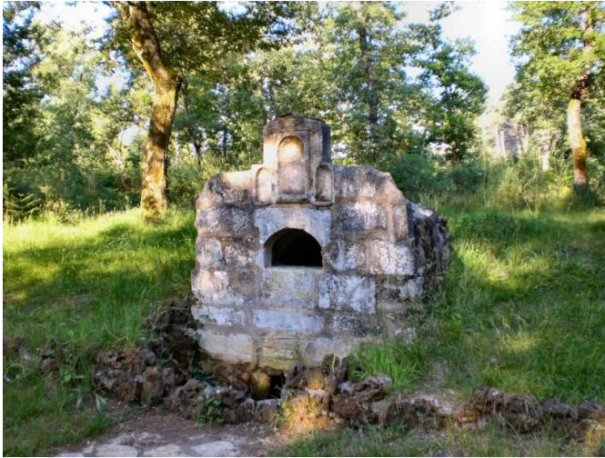
The Fontaine St Jean

From the Fontaine, KSO on the path, finally passing under the fast A660 with the railway alongside. Turn immediately L, doubling back to cross over the railway and descend to a cross-roads. Turn R here and continue west on a road parallel to the expressway. At the first road junction, KSO on this parallel road which eventually becomes a rough track. Continue for 500m on this track, then turn L on a broad grassy track alongside a drainage channel (no waymarking at this turn, but look out for the little concrete bridge over running water – the Pont Beynel – at the start). Continue south on this straight track for 8.5km to arrive at the D652. Cross over this road and KSO beside the fence on the perimeter of the airfield.