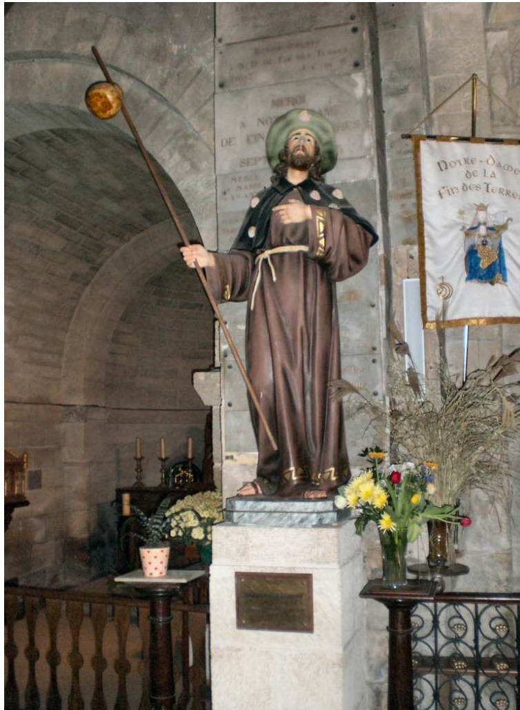
St James in the Basilica at Soulac

overgrown) and climb the hill to arrive at a broad track. Bear R on this track (you are now briefly on the GR10, a long-distance path that traverses the length of Pyrenees) and KSO to a tarmacked road immediately before a telecommunications tower. Turn L downhill, and after 150m take a road on the R. This descends with good views of the bay and harbour to meet a main road (D358) in Hendaye. Turn L on the D358, and at the roundabout in 300m, turn R. At a second roundabout 300m later turn L on the Rue de Santiago (initially a wide road but dwindling as you progress). Reaching a small roundabout (400m), bear ahead-right to descend to a main road (N111) at a complicated junction. Cross over, bearing half-right to a road SP Irún. This quickly climbs to arrive at the Pont St Jacques / Puerte de Santiago, the bridge over the Bidassoa that will carry you into Irún to continue the journey.