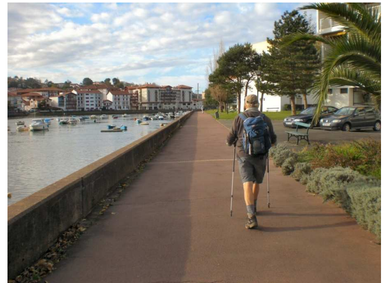
Walking into St Jean-de-Luz

At a lone pine tree, the track swings R, descending to cross a stream and then climbing out of the valley again. Reaching a narrow tarmacked road at the top, turn L and KSO, crossing the stream again to arrive at a road junction in 800m. Turn R with the road here, and continue for 1km to a junction with a much busier road. Turn L (take care – poor verges) and in 300m take a lesser road on the R, the Chemin de Chantaco (possibly a corruption of Santiago). This road now descends for 2km to meet the main D918 running along the bank of the Nivelle. Turn R here, keeping to the right of the road until under the autoroute bridge, then crossing to the promenade beside the river. KSO for almost 2km to pass under rail and road bridges side-by-side, very close to the centre of St Jean-de-Luz.