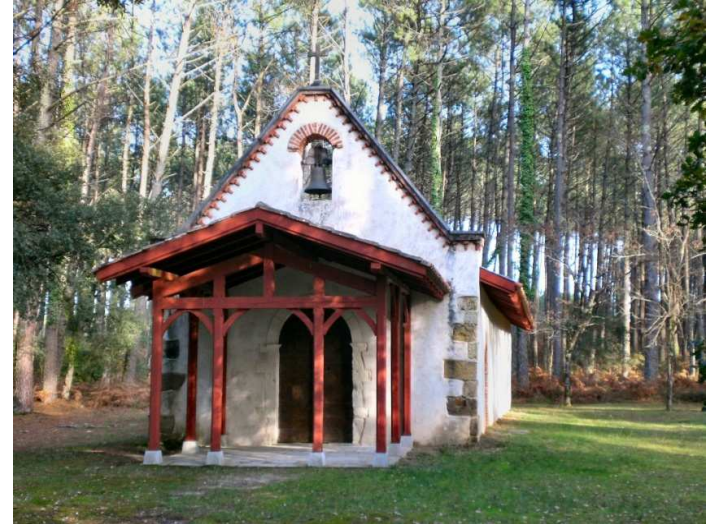
The Chapelle de Maa

wide track which becomes a tarmacked road in the village of Maquis. At a bend 300m later, take a signed track doubling back on the R and continue for 1.5km to reach the Chapelle de Maa.