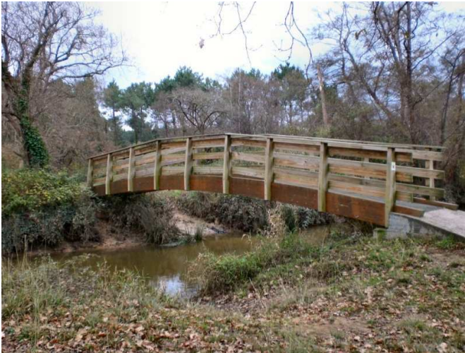
The bridge over the Anguillère

Camping Municipal Les Pins Bleus (1km off route – take main road to Labenne and turn L immediately after crossing river) offers tented accommodation for pilgrims at 10 euros/night. Tel 05 59 45 41 13 or e-mail camping@lespinsbleus.com . Open April to early November.