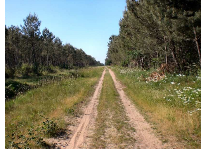
The straight path through the forest

19km Parentis-en-Born (186.6km) Population 4,400 Moderately-sized town at the eastern end of the large Étang de Biscarrosse et Parentis (from the route you don't even catch a glimpse of it). All facilities Office de Tourisme http://tourisme.parentis.com Tel 05 58 78 43 60 Summertime bus service to Mimizan. Range of hotels, chambres d'hôtes, campsites – see website Chambres d'hôtes des Arènes (100m off route in centre of town) Tel 05 58 78 51 30 Resto' hôtel Escale Landaise is an inexpensive 'truckers stop' on the route, 4km beyond Parentis (at the junction of D652 and D46). Terms are half-board – but if you want an early start, take breakfast to your room the night before. Reservation advised (Tel 05 58 78 40 30).